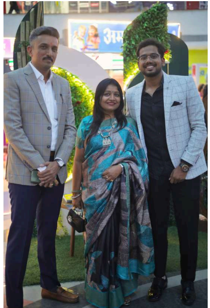
Founder @ Kshiteej Interiors