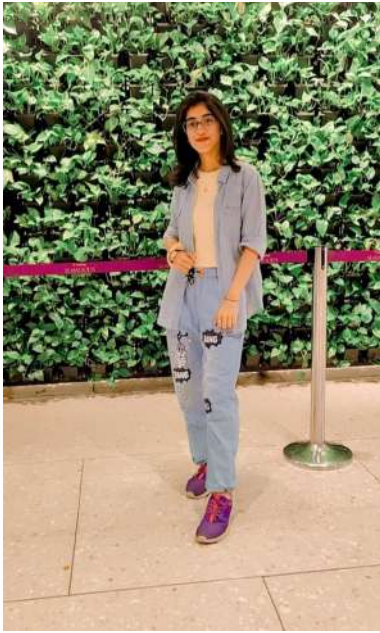
KUMKUM RAHTI NSPUNI.COM