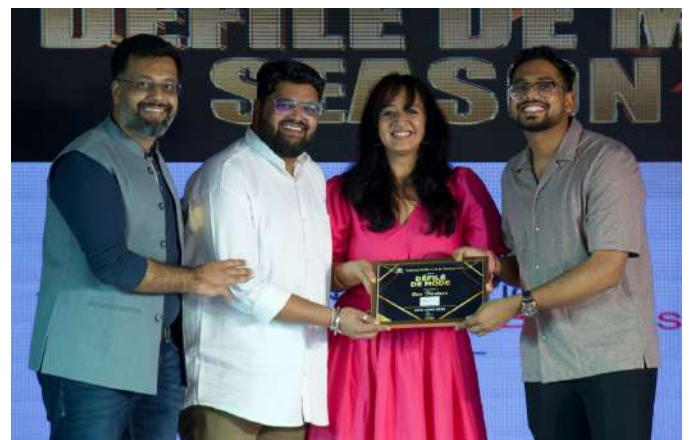
International Fashion Business Exchange Council