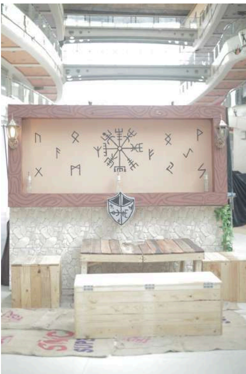
Name: Laxmi , Sameer Theme : Medieval Design