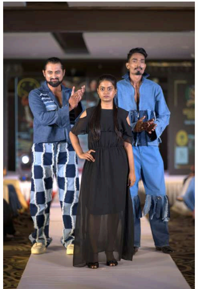
2ND YEAR COLLECTION