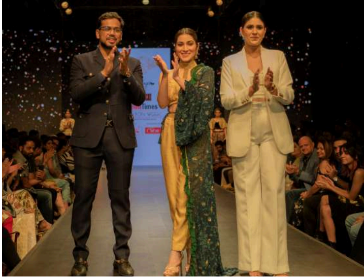
DELHI TIMES SEASON 1