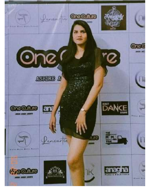
PAYAL GAUTAM DAZZLE BOUTIQUE