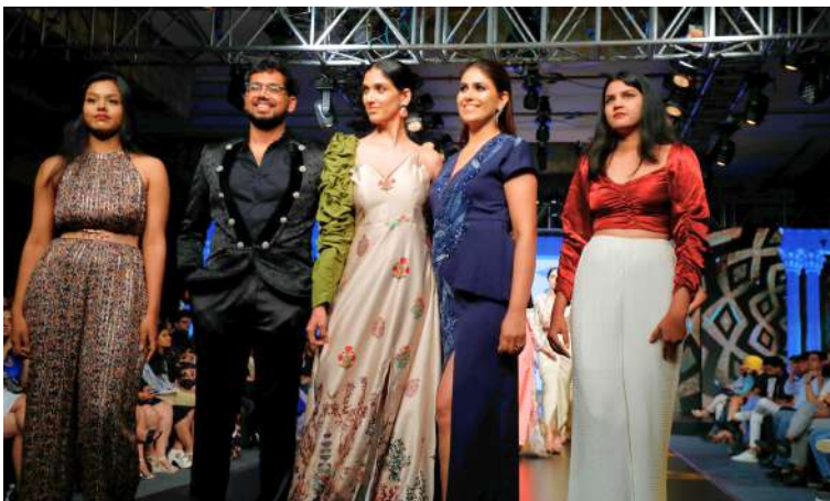
DELHI TIMES SEASON 2